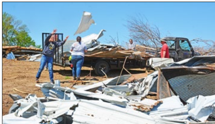
More building debris is tossed on a pile in the field north of the Saunders home.