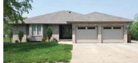
5 bedrooms - 3 Baths