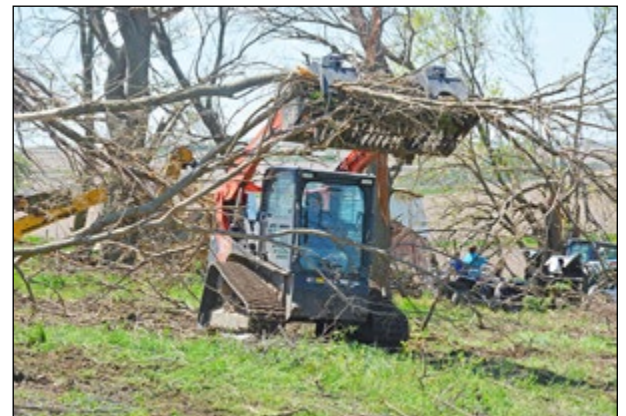
Machines like this one made short work of tree debris.