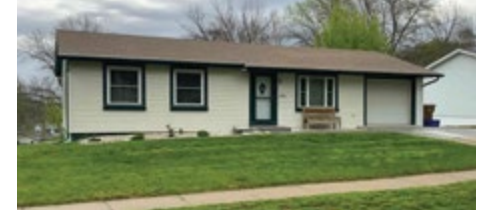
3-5 bedrooms - 2 1/2 baths