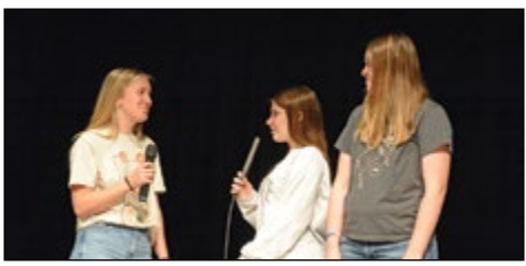
Reasons not to perform a play