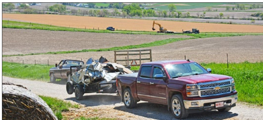
A trailer full of debris is pulled up the Saunders driveway.