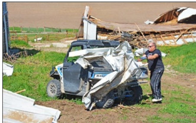
Debris from a building on the Saunders farm is thrown into a pile.